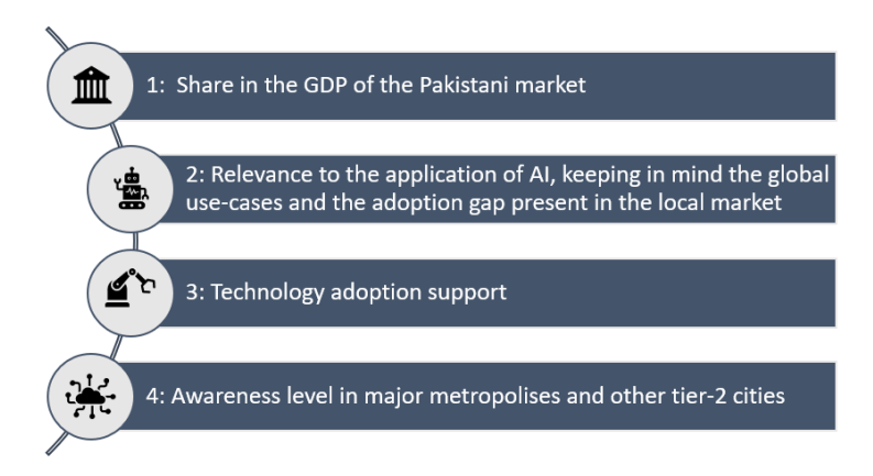
Figure 1: Criteria for the identification of sectors in society in relevance to AI adoption

Sectoral identification is essential to strategizing AI proliferation in Pakistan. These areas can socioeconomically benefit the most from AI adoption and progress by engraining AI technology in its operations. The stakeholders in Pakistan are those areas of society with significant potential for AI adoption and where this technology can lead to substantial progress. The classification of sectors has been done based on the following criteria, as shown in the figure below.